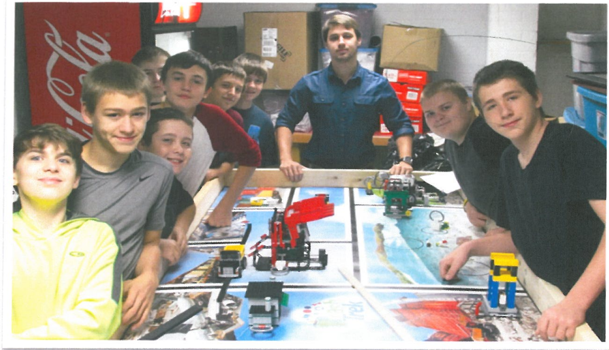
Students at Sherman Jr. High School working on their robotics projects!