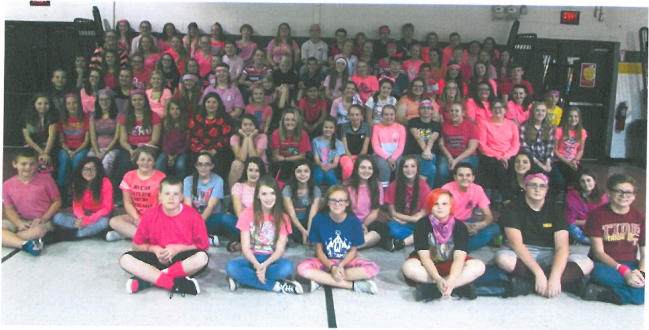
Students at Sherman Jr. High School "PINK OUT" for Breast Cancer Awareness!