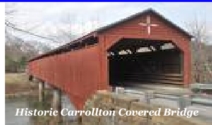
Historic Carrollton Covered Bridge