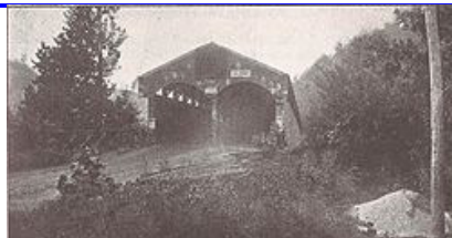
Rare 1899 Photo of the Covered Bridge