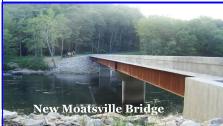
New Moatsville Bridge