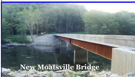
New Moatsville Bridge