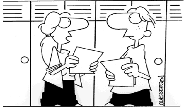
"I'm lousy at spelling because of my parents. They grew up listening to the Beatles, Monkees and Byrds!"