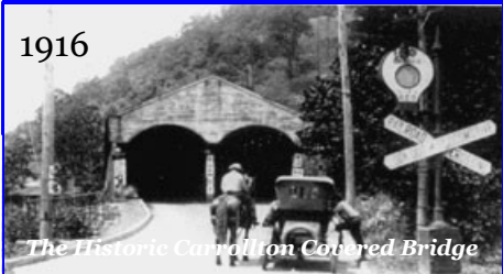
The Historic Carrollton Covered Bridge