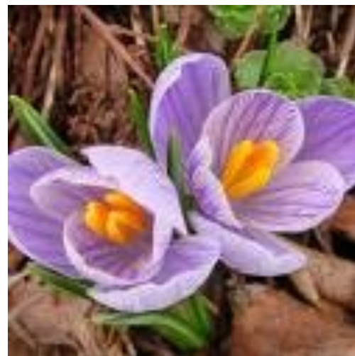
Finally...It's In The Air!